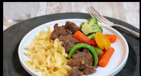
Braised Beef Tips