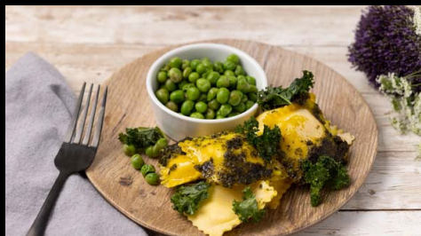
Butternut Squash Ravioli