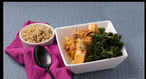
Red Peanut Curry