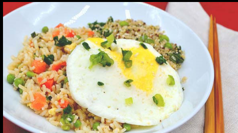
Breakfast Fried Rice