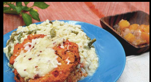
Provencal Bean Cakes