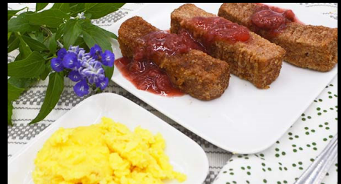
French Toast Sticks