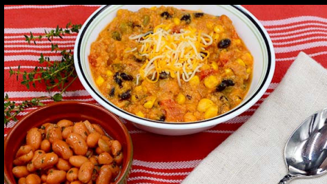
Chicken Tortilla Soup