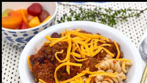
Beef Chili Mac