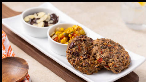
Jamaican Red Bean Cake