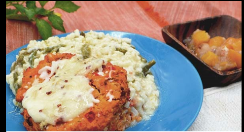
Provencal Bean Cakes