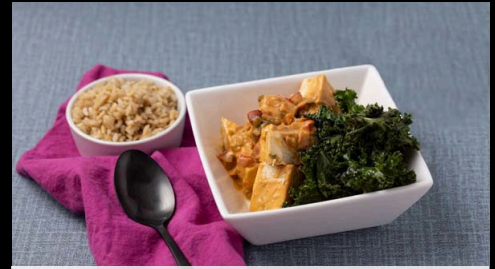
Red Peanut Curry