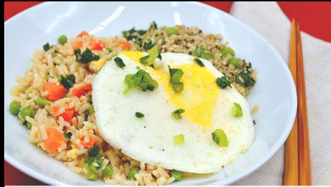
Breakfast Fried Rice