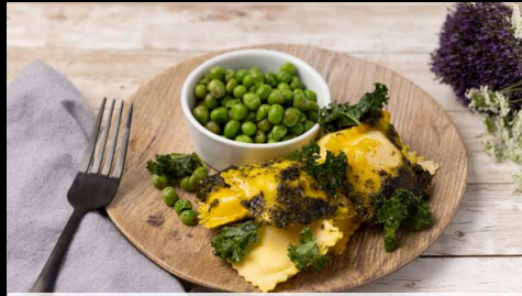
Butternut Squash Ravioli