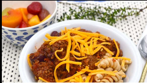
Beef Chili Mac