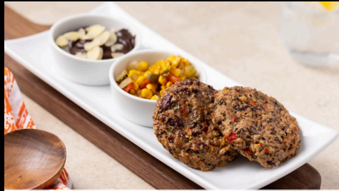
Jamaican Red Bean Cake