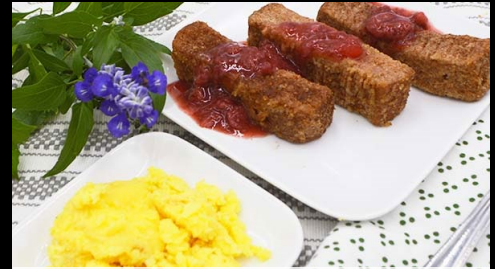
French Toast Sticks