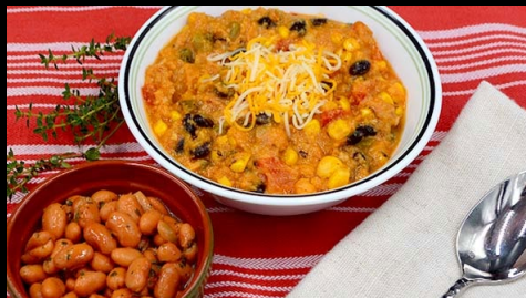
Chicken Tortilla Soup