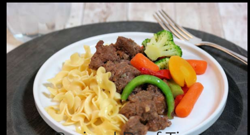
Braised Beef Tips