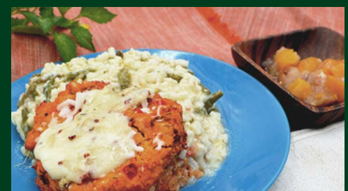
Provencal Bean Cakes