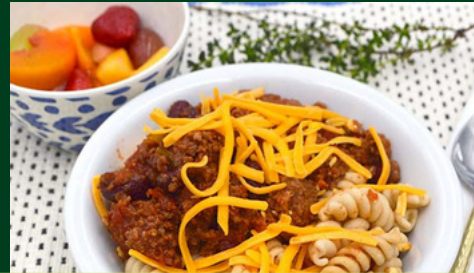
Beef Chili Mac