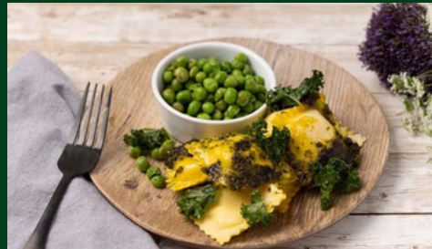
Butternut Squash Ravioli