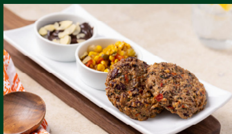
Jamaican Red Bean Cake