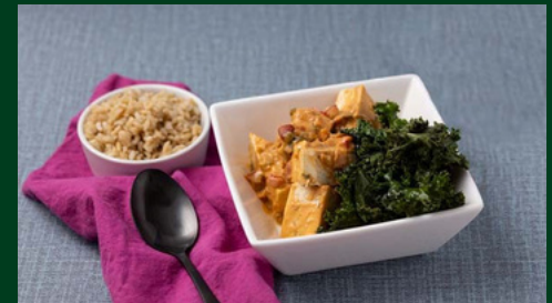
Red Peanut Curry