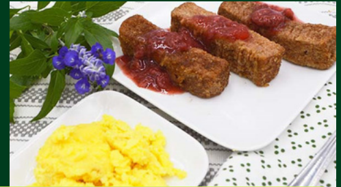
French Toast Sticks