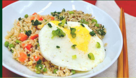
Breakfast Fried Rice