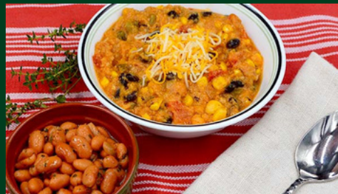
Chicken Tortilla Soup