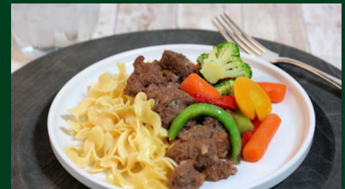
Braised Beef Tips